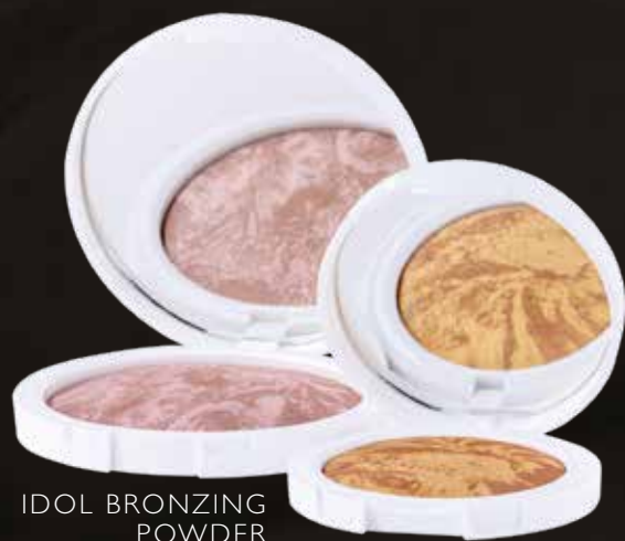
IDOL BRONZING POWDER

Light texture and easy to apply. The SPF 30 or 50 provides the best UV protection.