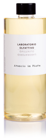
Arancio in Fiore