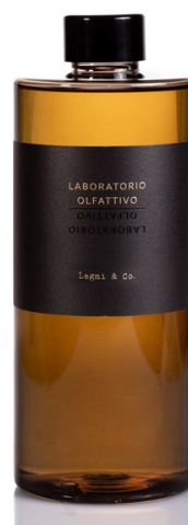
Legni & Co.