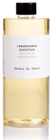
Petali di Tiaré